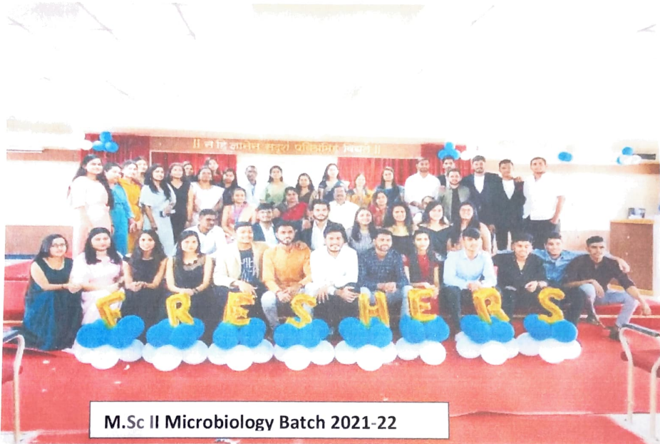
M.Sc II Microbiology Batch 2021-22