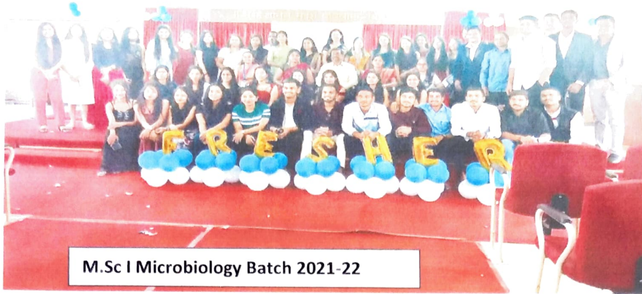
M.Sc I Microbiology Batch 2021-22